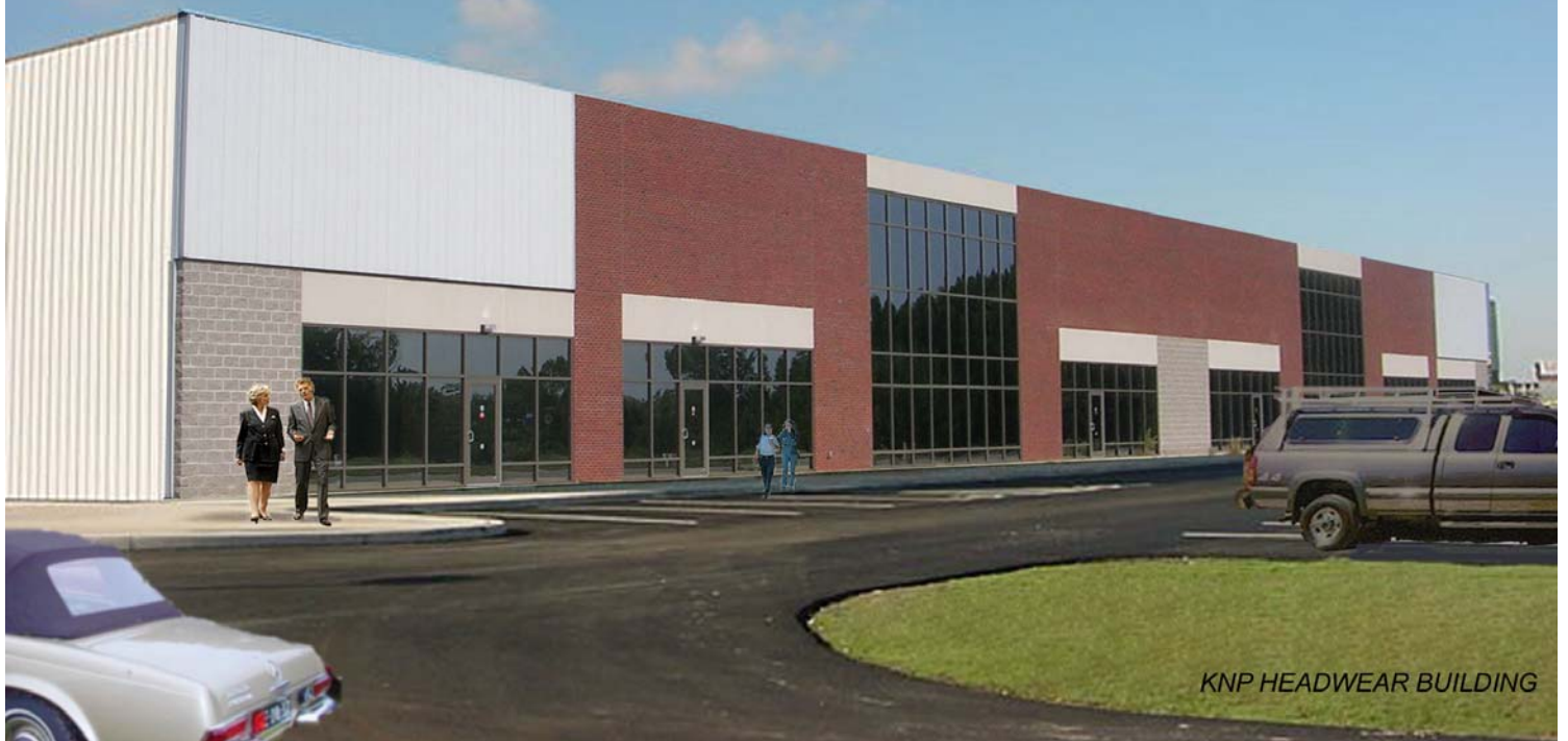
KNP HEADWEAR BUILDING