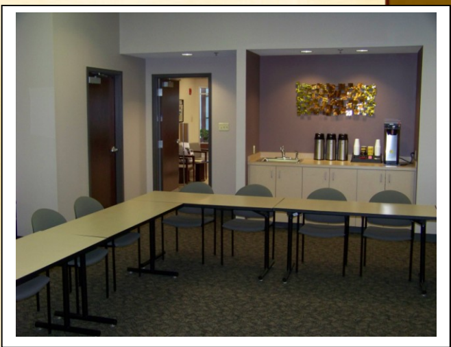
The beverage station is large enough for all attendees to enjoy a hot coffee.

Niagara County Center for Economic Development