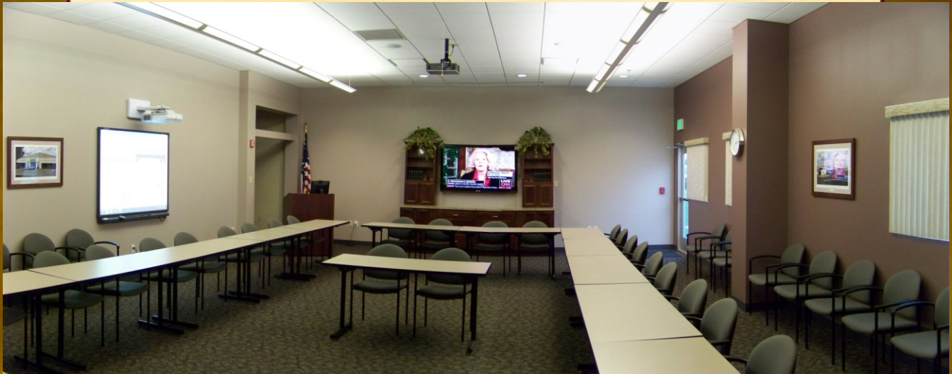
Our large conference room comfortably accommodates 50 persons.