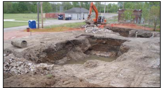
Former Underground Storage Tank Area