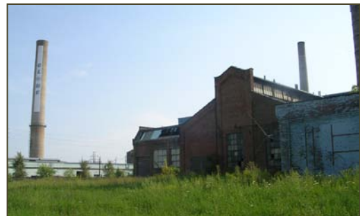
Site Building – August 2008

Santarosa Holdings, Inc. intends to remediate the site and redevelop the property for tire related recycling businesses. During 2009, the company experienced issues with the asbestos contractor and work was put on hold. During 2010, the company continued to work with their contractor to resolve the pending issues and began soil testing at the site to determine the nature and extent of remaining site contamination. It is anticipated that during 2011, the company will complete the asbestos abatement, closeout the BCRLF loan, and conduct the remaining site remediation rendering the site ready for reuse.