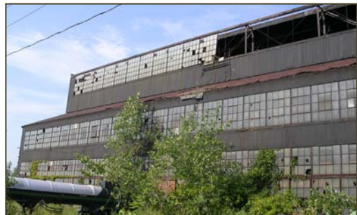
Back of Building – August 2008