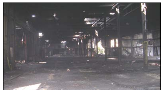
Inside Main Building – March 2006