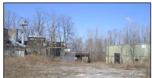
Dussault Site – March 2006

Grant funds will be used to remove the approximate 67,950 square feet of asbestos containing materials. In September 2010, an environmental consultant was hired to prepare the plans and specifications for asbestos abatement. It is anticipated that the project will be completed in early 2011.