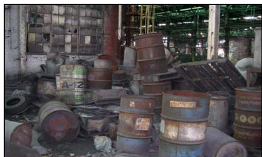
Drums in Main Building – August 2008