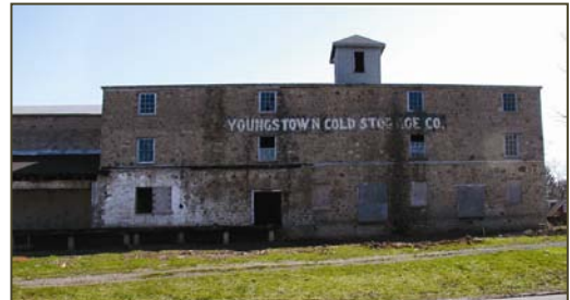
YCS Main Building – March 2010

Site remediation cost approximately $230,000 and was completed to NYS residential reuse standards. The proposed reuse of the site is for senior housing. The Village of Youngstown is actively marketing the site for this type of redevelopment.